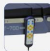
Y-002 cable controller