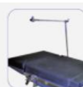
Y-008 anaesthesia screen