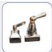
P-001/P-002 lock block/clamping block