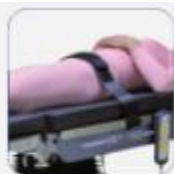
Y-006 fixed belt