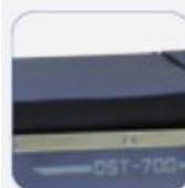
Y-001 mattress pad