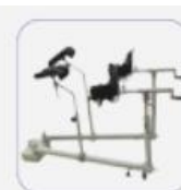
D-001 orthopedic tractor